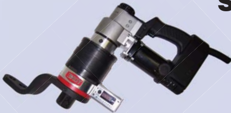
"TOWER MASTER" Electric Torque Wrench