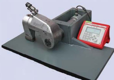
Hydraulic Torque Wrenches

Use in the Horizontal or Vertical position