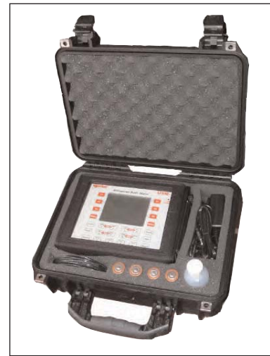
USM-3 and Case

Accuracy of Elongation: +/- 0.0003 in (+/- 0.008 mm) or 0.001% of reading if greater.