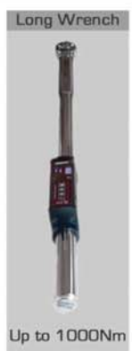
Up to 1000Nm

Note* Wrench can be configured to have any range from 10-100%