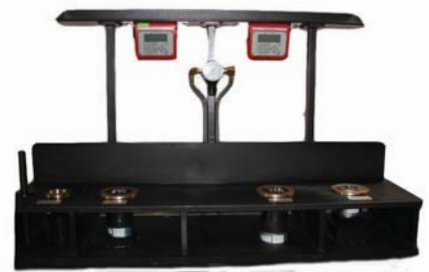
In-House Test Equipment

Transducerized Static Test Tables for Electronic, Hydraulic and Pneumatic Torque Wrenches. Dynamic Torque Testing of tools and equipment designed to your specific testing requirements.